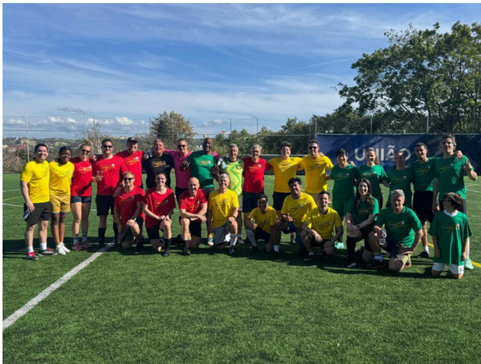
LAWorld World Cup Tournament