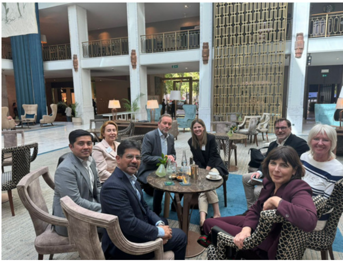
LAWorld New Executive Committee