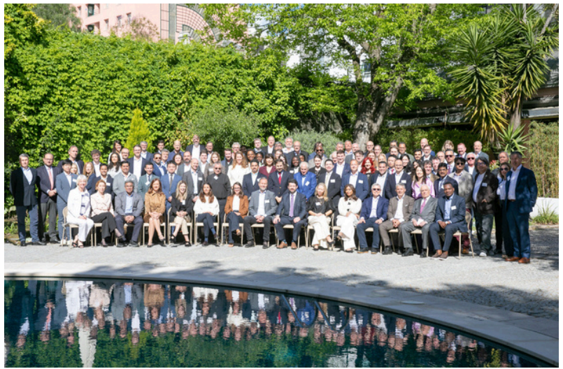
LAWorld Lisbon AGM delegates